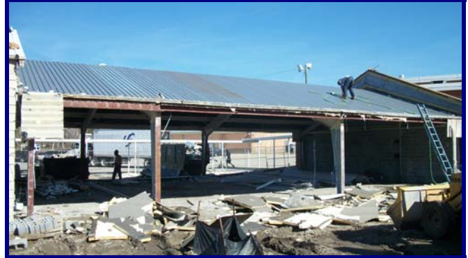
Demolition of Existing Weight Room in Progress