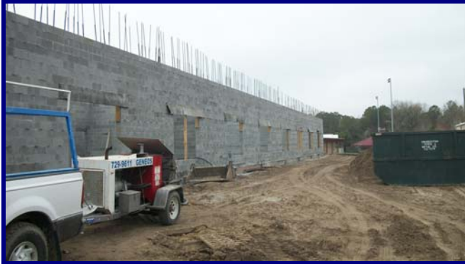
CMU Walls Installed to Steel Bearing Height

The contractor has initially indicated that the original contract completion date can be achieved. Change Order Number 1 has been executed for the project and includes a contract time extension in response to inclement weather days.