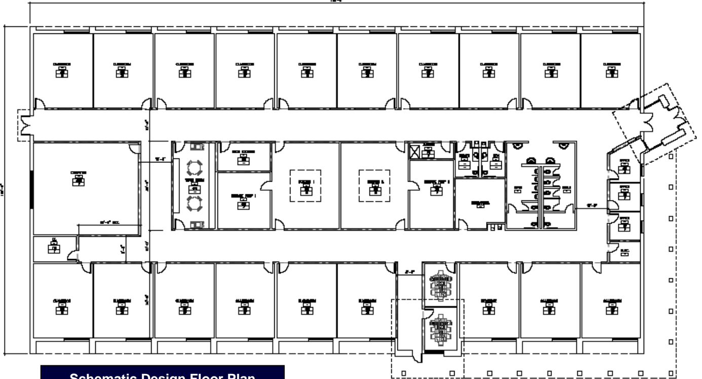
Schematic Design Floor Plan