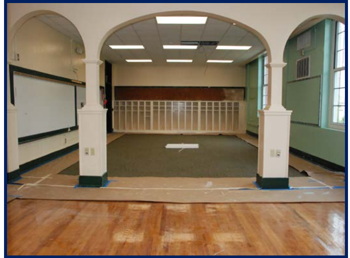
Chicora Move to McNair Campus Painting and Flooring Complete at Classrooms