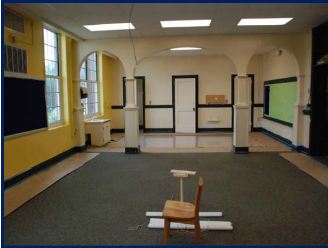
Chicora Move to McNair Campus Initial Building Cleanup Complete for new Work