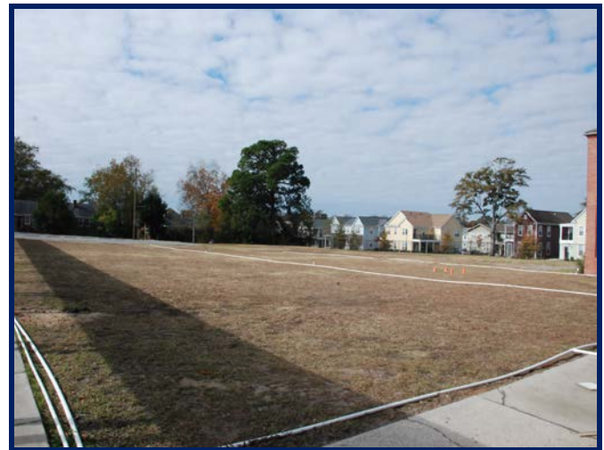
Chicora Move to McNair Campus Grassing and Irrigation at Play Area