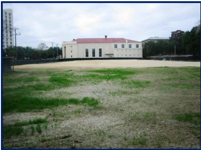
Completed Building Pad View from Elementary Playground Area