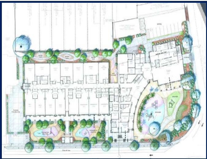
Memminger Elementary School Landscaping Plan