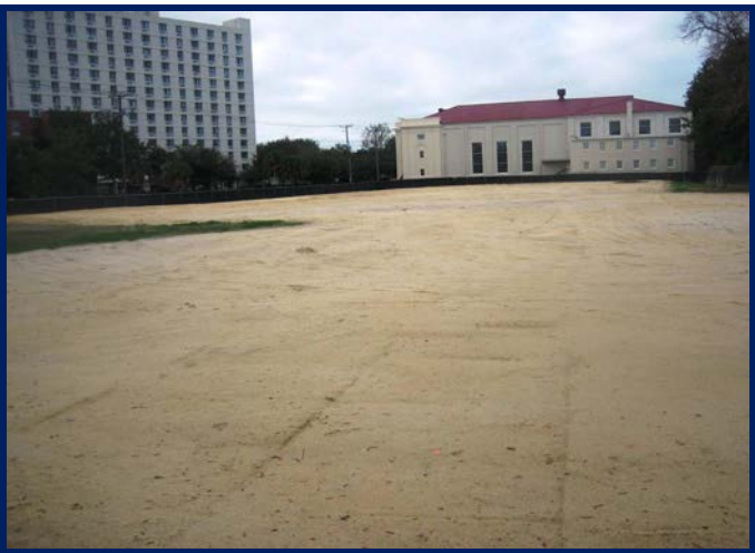
Completed Building Pad View from Cafeteria / Multipurpose Building