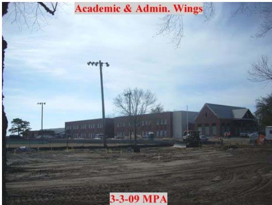
Academic & Administrative Wings

First shareholders meeting held on Dec 17, 2008. Next shareholders meeting scheduled for March 18, 2009.