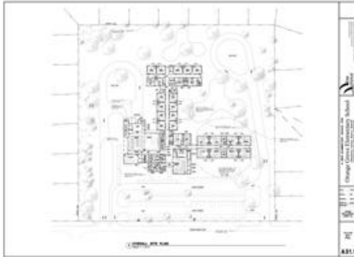
Overall Site Plan